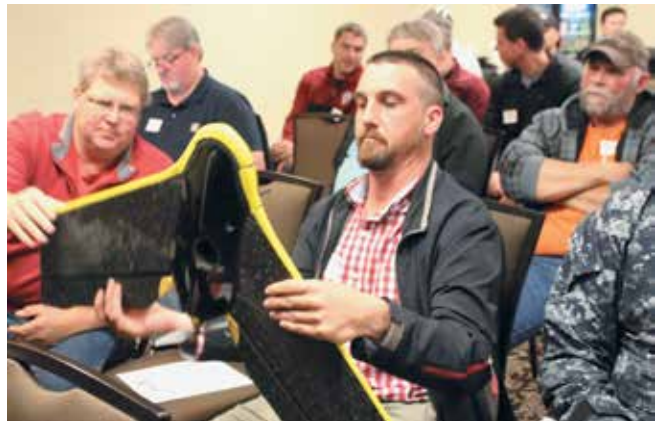
Drones take center stage at the chapter's recent NW Technology Summit showcasing cutting-edge technology applications used on excavation jobsites.