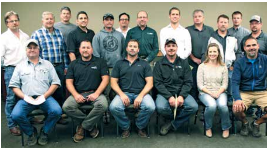
The core group poses at its first historic gathering, Sept. 15, 2015, giving birth to their NUCA chapter. Discussions identified common issues impacting the Inland Northwest’s excavators that a unified group could address.

For information on Spokane-area membership and events, visit www.nucaNW.com . Office: (509) 795-1011. Email: spokane@nuca.com .