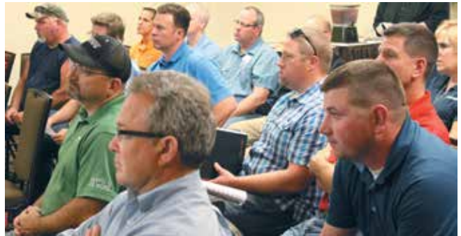
Construction industry reps gather in Spokane Valley for the first-ever NUCA NW Infrastructure Summit, featuring updates from Avista, Fatbeam and the region's major utility companies.

So much so that a new NUCA Chapter has emerged strongly in this region, spearheaded by the excavators and supplier companies based there.