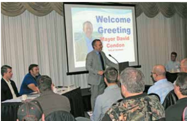
Spokane Mayor David Condon kicks off the chapter's inaugural event, praising the industry for its vital work in building the region's infrastructure.

The idea quickly gained momentum among Inland Northwest excavators, banding together in September 2015 as a core group. Within weeks, the group's ranks grew to 25 representatives who attended their first formative meeting in Post Falls, Idaho.